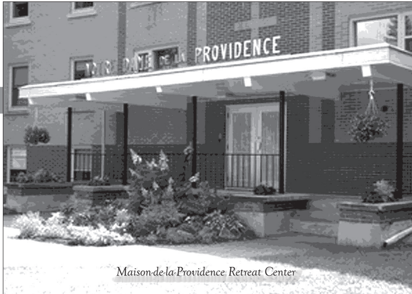
Maison-de-la-Providence Retreat Center