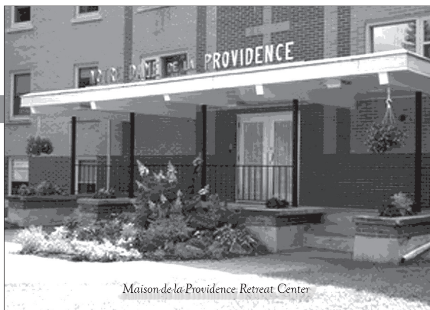
Maison-de-la-Providence Retreat Center