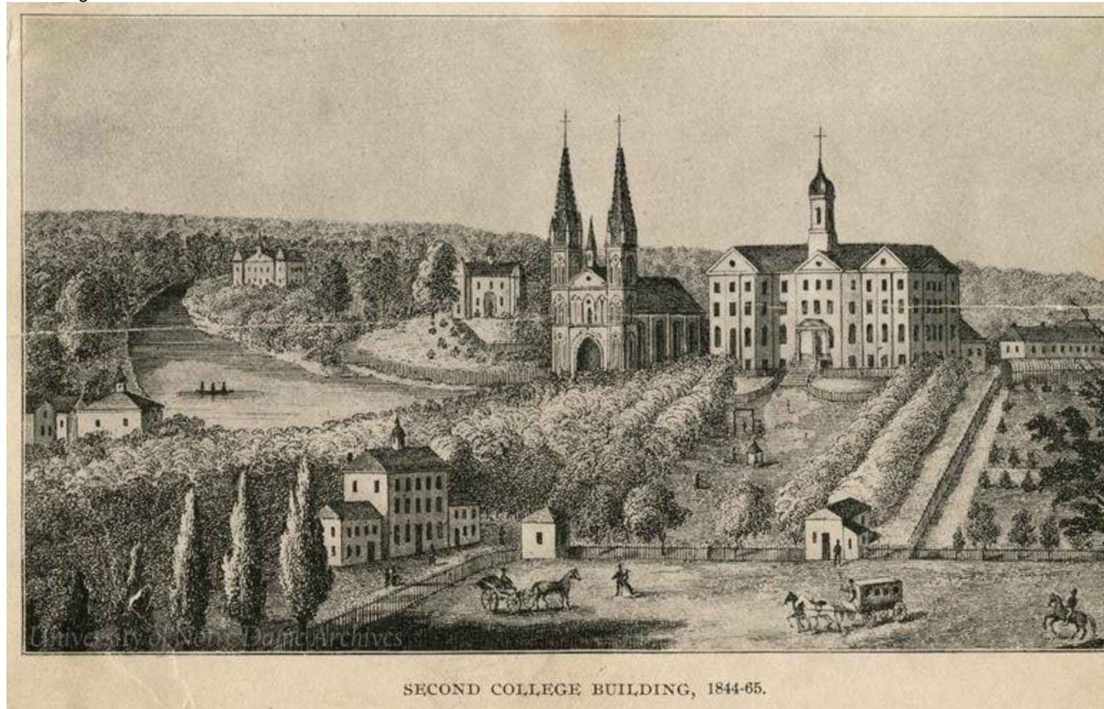
SECOND COLLEGE BUILDING, 1844-65.