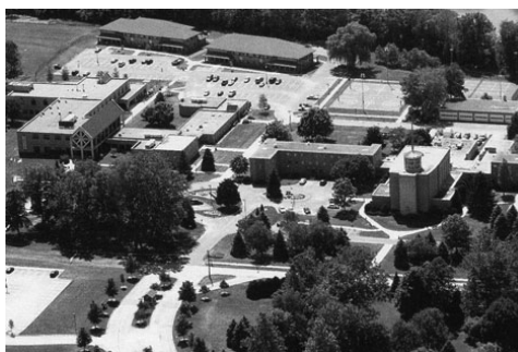
aerial view Holy Cross College