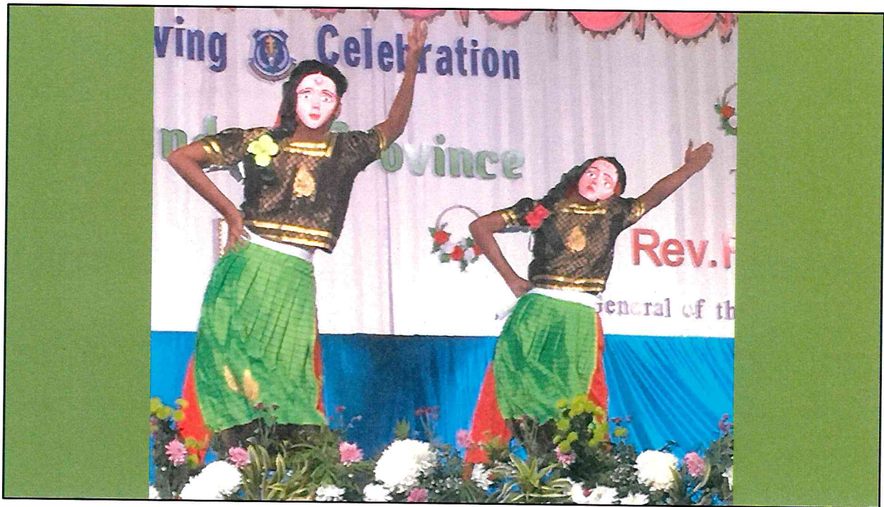
These dancers were very creative – displaying split personalities for both women