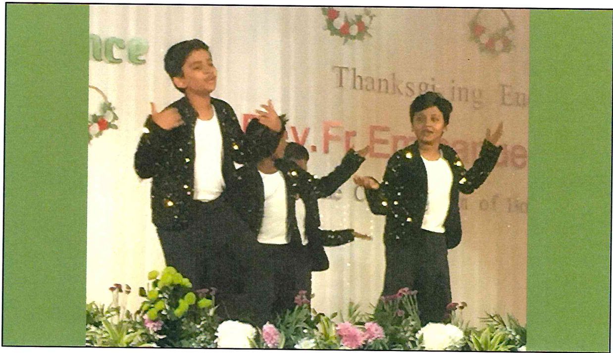
Some of the students were liberal in their interpretation of cultural performance and danced to more modern Indian pop music