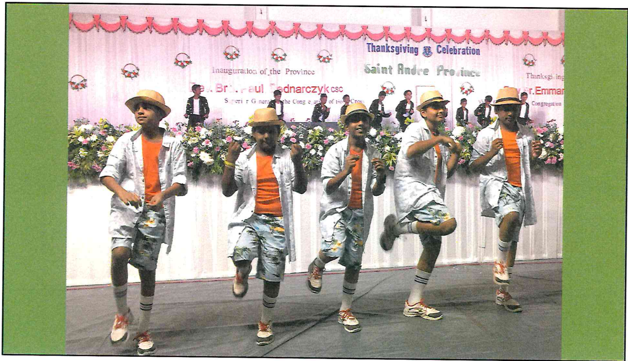
Each group had their own costumes