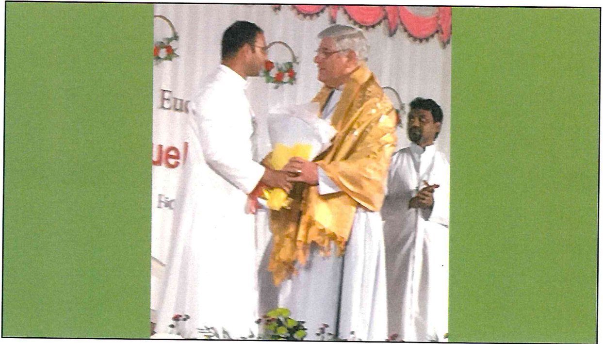
After Mass, each distinguished quest was honored with flowers and a customary shawl from the new province.