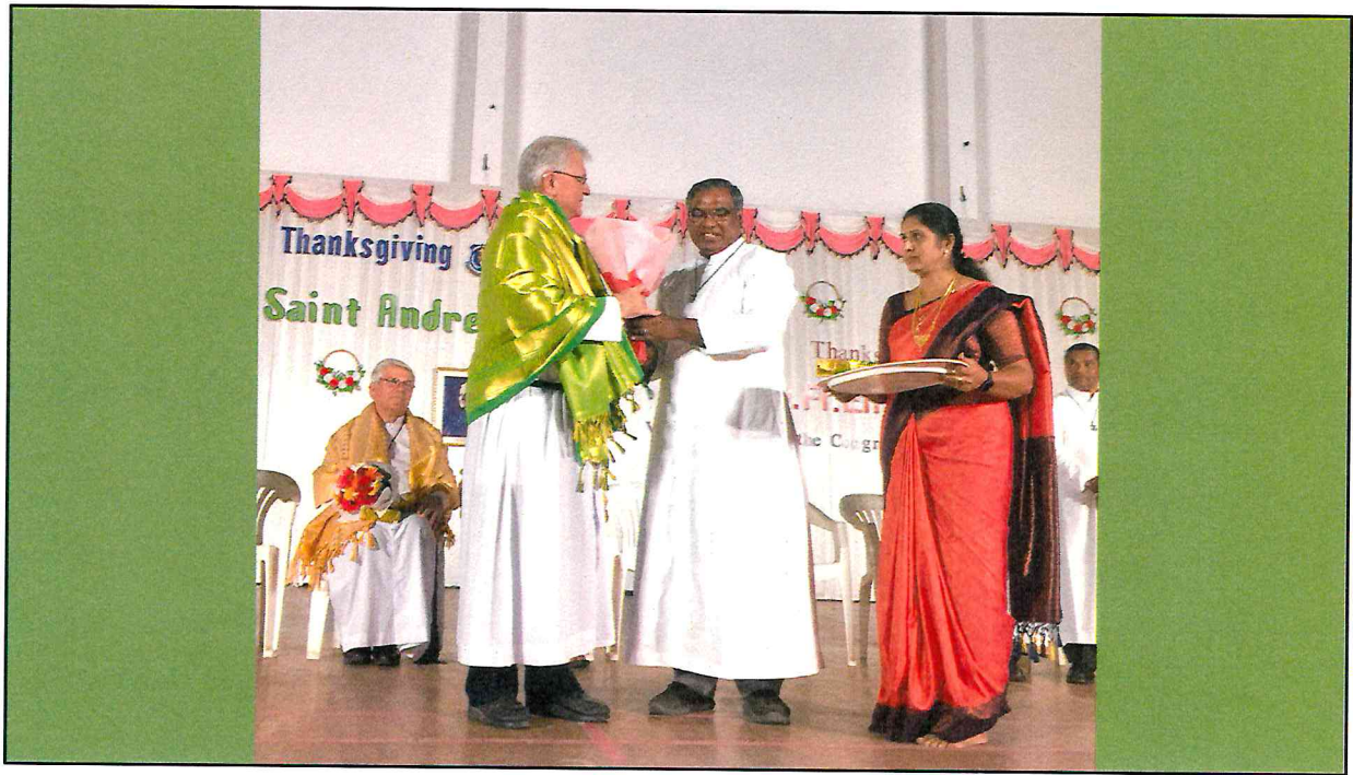
Several groups associated with the brothers and their schools were present and also presented flowers and shawls to the distinguished guests