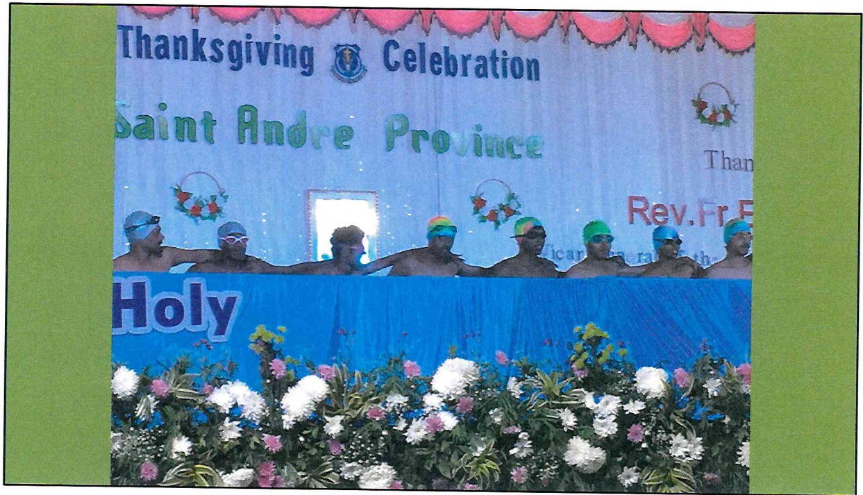
One of the last groups displayed a synchronized "swimming" routine